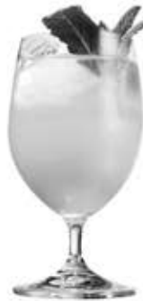
Pornastar Spritz Pornastar Cocktail mix Prosecco