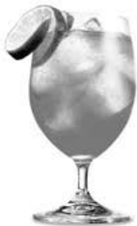
Mulberry & Sloe Chase Mulberry & Sloe Gin, Sicilian Lemonade, Prosecco