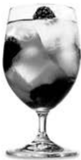
Classic Aperol Spritz Aperol, Soda Prosecco