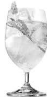
Elderflower Spritz Chase Elderflower, Soda, Prosecco