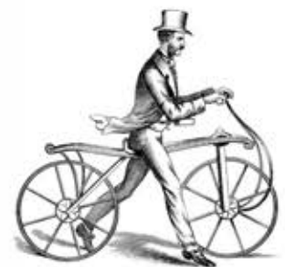
The "Dandy Horse"

WHERE OLD MEETS NEW AND THE TWO HIT IT OFF REALLY QUITE SPECTACULARLY. BRIGHT FLORAL MEADOW NOTES ON THE NOSE, SWEETNESS OF ZESTY LEMON AND CITRUS, A ROUNDED SMOOTHNESS ON THE BACK OF THE PALETTE WITH A HINT OF SPICE AND VIOLET ON THE FINISH.