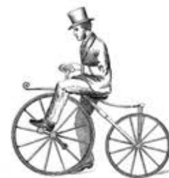
© The "Bike-shaker"

THE GIN IS COOL AND CLEAR IN THE GLASS, WITH A COMPLEX YET LIGHT FRAGRANCE OF THE WILD INGREDIENTS. THE PREDOMINANT INITIAL TASTE IS OF JUNIPER, WITH ADDED CITRUS NOTES FROM THE CORIANDER SEED. NEXT, THE SWEETNESS OF THE BERRIES COMES THROUGH, ACCOMPANIED BY HERBACEOUS NOTES PROVIDED BY FERNS, FLOWERS AND PINE.