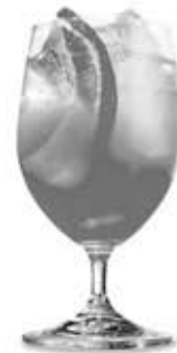
Aperol Grapefruit Spritz Aperol, Grapefruit juice, soda, Prosecco