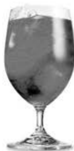
Sbagliato Campari, Sweet vermouth, Soda, Prosecco