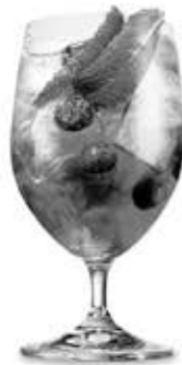
Cointreau Spritz Cointreau, Soda, Orange Juice, Prosecco